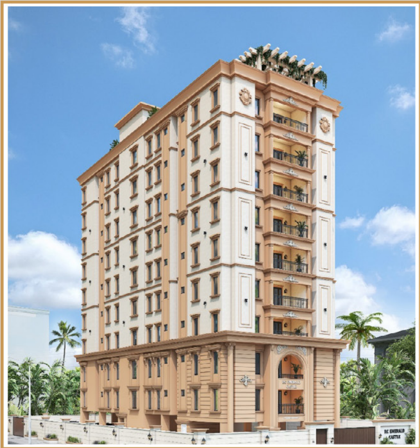
RC - EMERALD CASTLE @ Crawford, Trichy

Stilt + 4 Floors 8 UNITS | 1295 - 1355 Sq.ft 3 BHK