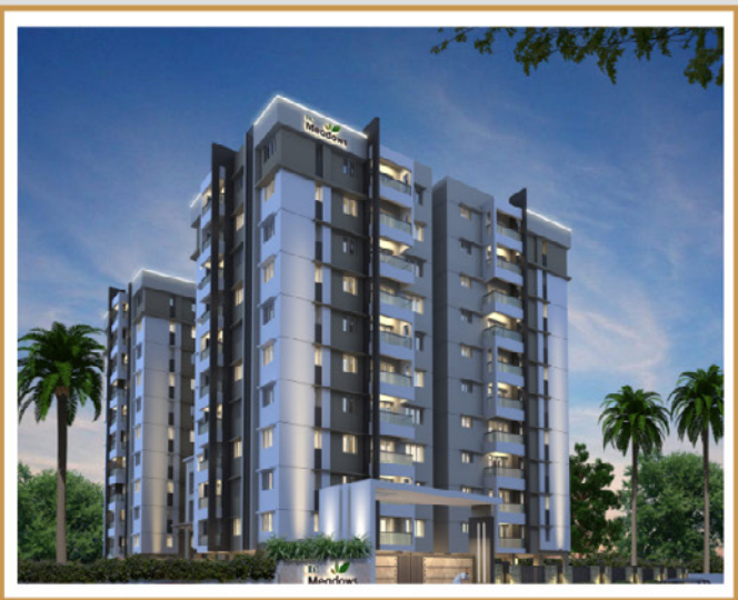
RC - MEADOWS Kolathur

Stilt + 5 Floors 50 UNITS | 890 - 945 Sq.ft 2 BHK