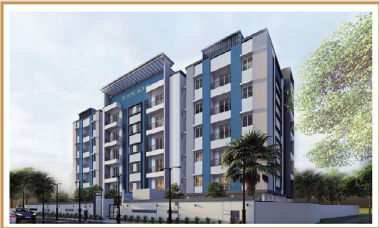
RC - ROSEWOOD Redhills

2 Stilt + 8 Floors 128 UNITS | 910 - 1430 Sq.ft 2 & 3 BHK