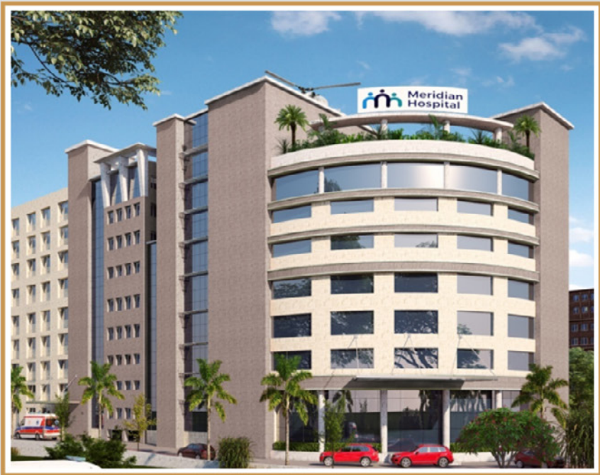
MERIDIAN HOSPITAL Kolathur

Stilt + 9 Floors 18 UNITS | 2075 - 2500 Sq.ft 3 & 4 BHK