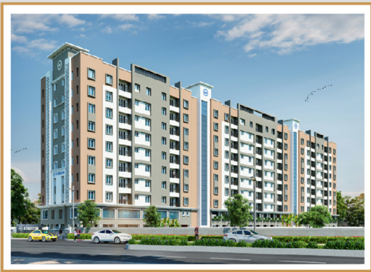
RC - KINGSTON Moolakadai

2 Stilt + 8 Floors 128 UNITS | 910 - 1430 Sq.ft 2 & 3 BHK