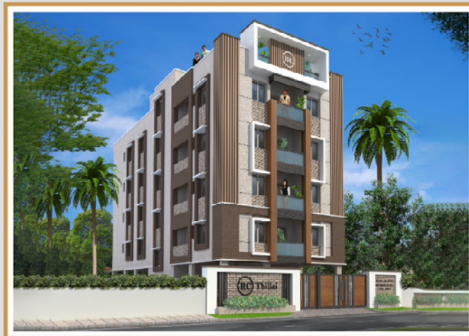
RC - THILLAI Thillai Nagar, Trichy

Stilt + 10 Floors 90 UNITS | 1235 - 1880 Sq.ft 2,3 & 4 BHK